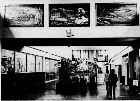
Marking Twain's Life

neighborhood don't even chase, she said. "Everything in the neighborhood is getting so bad," said one woman. "That's the thing I love about my neighborhood is to go to the park and see the blackbirds."